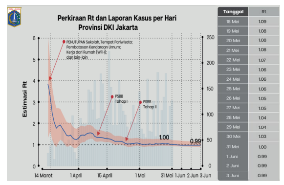
Figure 2 RT Graph (DKI Jakarta Virus Reproduction